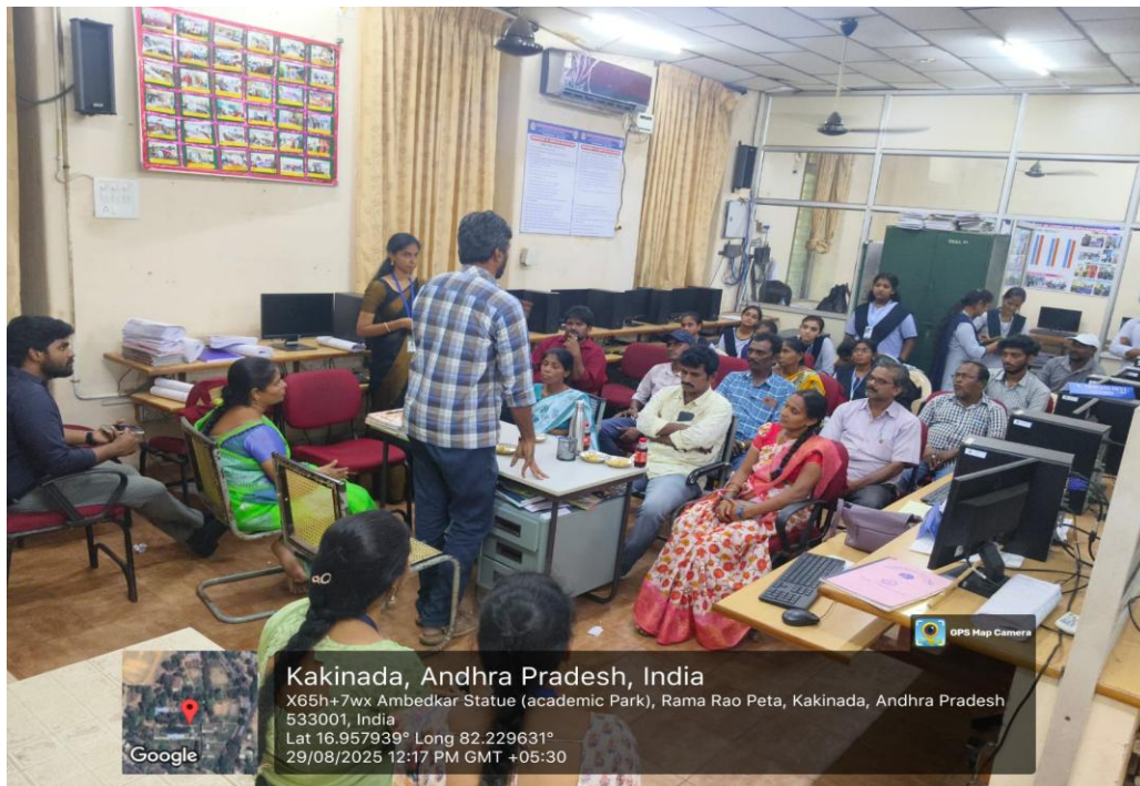
The Academic Co-ordinator addressing the gathering.